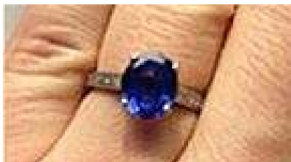
Bride's ring stolen as she said vows