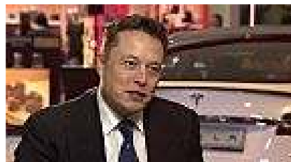
PayPal billionaire 'expected to fail'