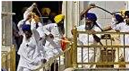
Sword fights erupt at Sikh temple