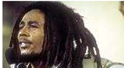
Bob Marley's dad's WW1 'sick leave'