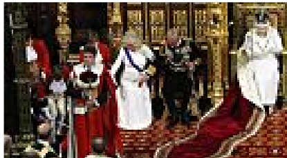
Queen's pageboy faints during speech